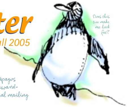
Penguin from "Galápagos Sketchbook", our award-winning promotional mailing