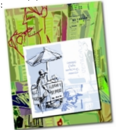
Our "Images from Veracruz" promotion

Winning projects will appear in GDUSA's December issue.