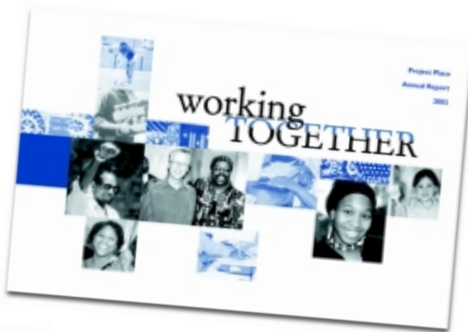
Cover of the 2003 Project Place Annual Report

RETURNING CLIENTS: Project Place returned for production of their 2003 Annual Report; invitations to their 2004 Golf Fundraising Event; a new Strategic Plan booklet to outline actions to focus their mission and programs over a 3-year period; and updates to their website, www.projectplace.org , that we created in 2002.