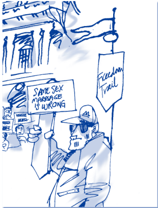
Detail from our illustration in the Boston Globe

20 Piedmont Street Boston, MA 02116 phone: 617.695.1400 fax: 617.695.1410 sbdesign@shore.net www.stephenburdickdesign.com