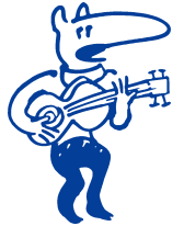
Mascot for the Bank's ad campaign

MERGER MANIA: Wainwright Bank asked us to develop ads and posters for their Merger Campaign, luring customers disappointed with results of the merger of local banks with Bank of America. The campaign included the development of a "mascot" – a character that appears on the materials in various situations. Response from clients and local advertising professionals was impressive.