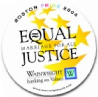
Promotional pin for Wainwright Bank saluting Boston's Pride events

"I WANNA BE A PRODUCER!": Our friends at Wainwright Bank asked us to produce banners, badges and advertising materials for their sponsorship of Boston's Pride events. Part of that project included creating three 10-second television spots to be shown on a Jumbotron during the festivities. We created the ads (basically type quotes fading into their logo) using a slideshow presentation program, then converted them to video with the help of a local video transfer company – creating a low-cost, high-impact promotion for the Bank!