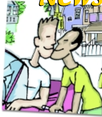
Detail from Bay Windows' travel insert cover