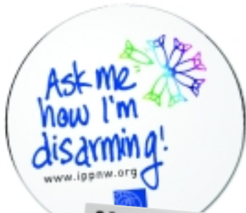
button and magnet design