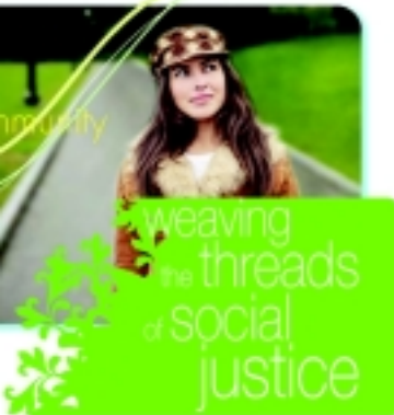
annual report design