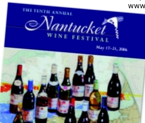
event program design