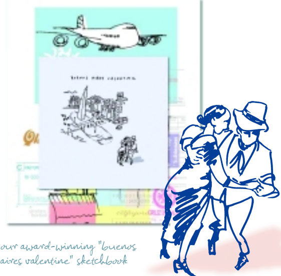
our award-winning "buenos aires valentine" sketchbook

KEEP INFORMED: Download this and our past newsletters on-line at www.stephenburdickdesign.com/sbdnews.html . If your addressed contact is outdated or incorrect, help us update our snail-mail list by emailing us at sbdesign@shore.net Cheers!